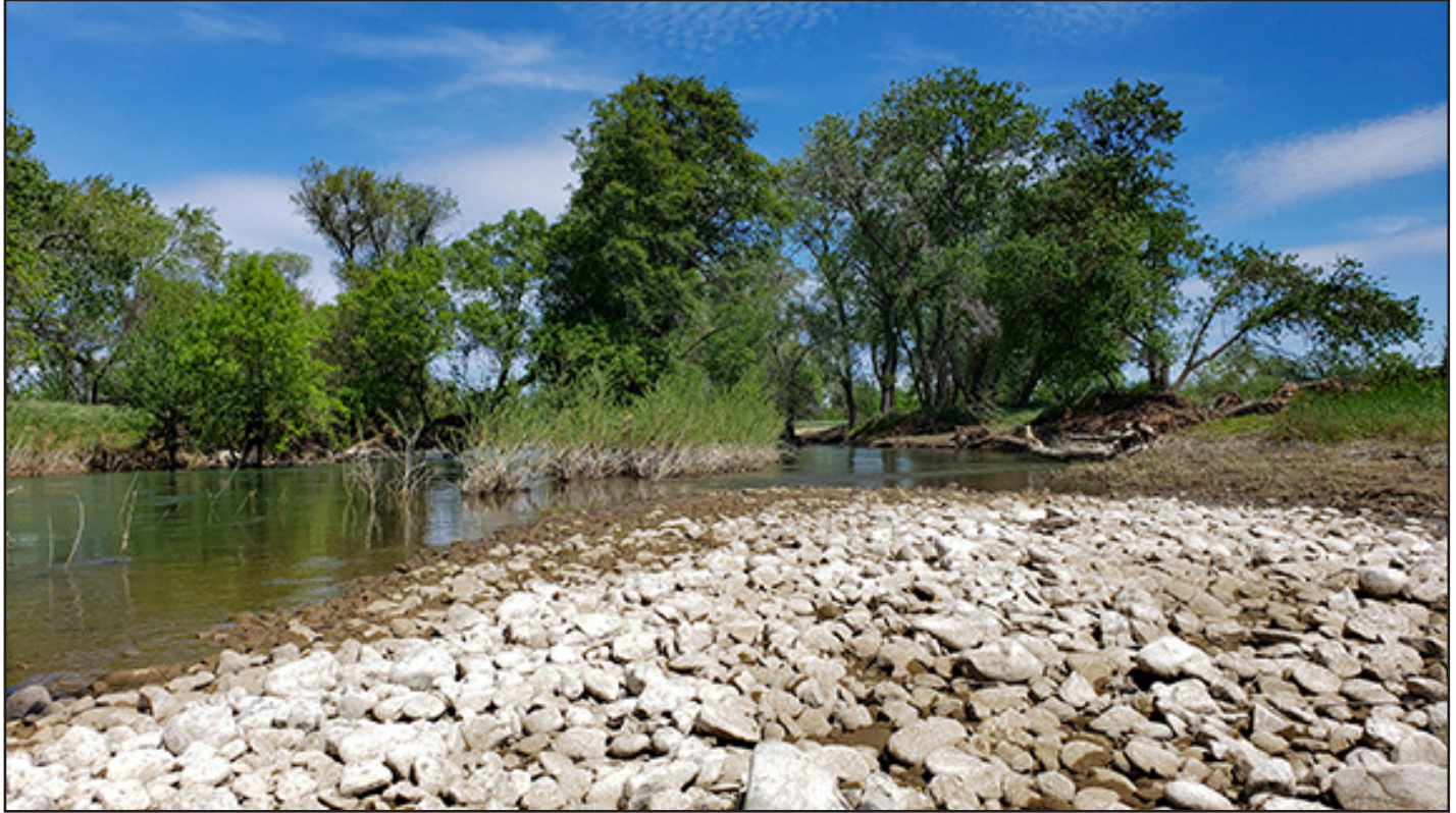
Upper section of Morales property on April 14, 2019

Transmitted via e-mail on April 15, 2019