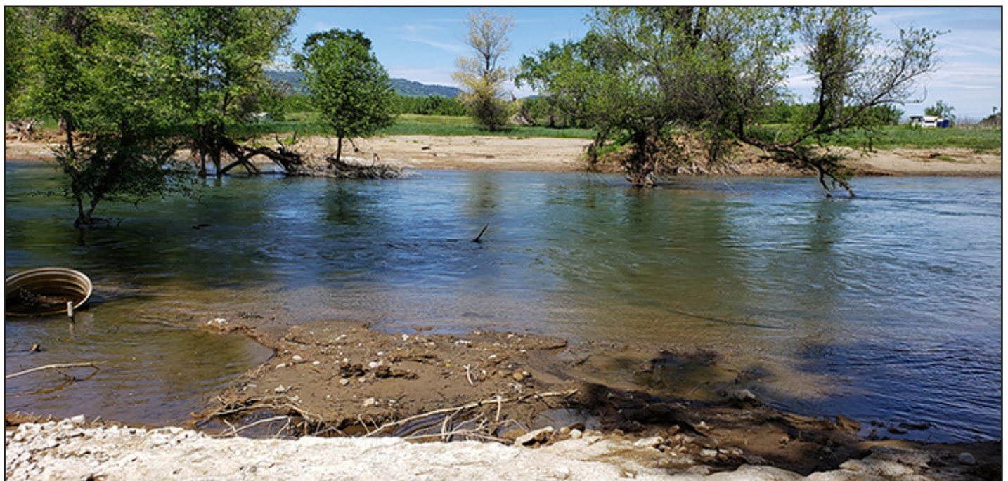
Pickerel Crossing on April 14, 2019