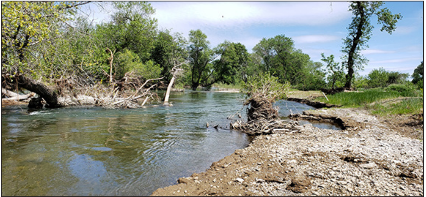
Section between Cody and Harris properties on April 14, 2019