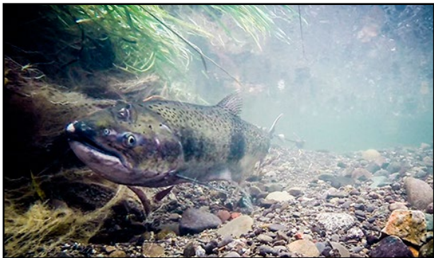
Female Chinook resting in area underneath overhanging vegetation in Pickerel North Side Channel.