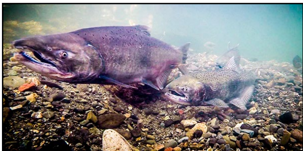
Paired salmon on Scarification Section No 6. Additional case showing large (normal size) male and 18 inch female