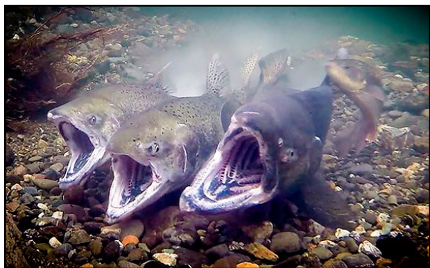
Salmon spawning in Scarification Section Number 6.