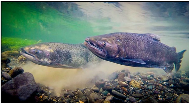
Chinooks paired on Scarification Control Section