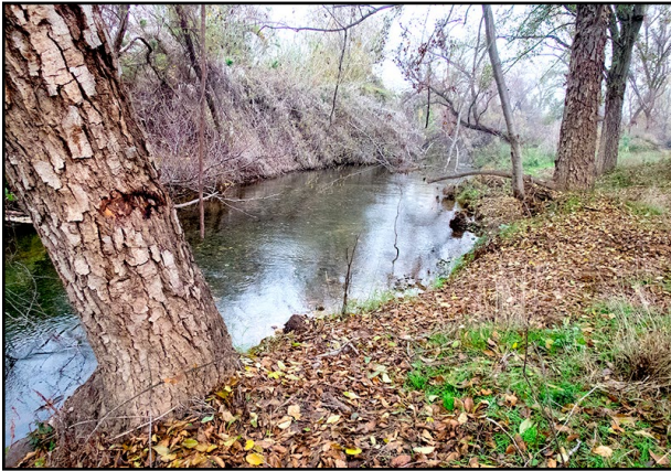
Scarification Section No 3. Lower Putah Creek