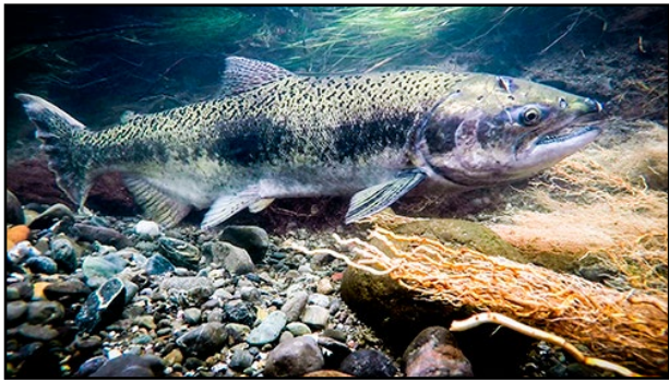
Salmon moving under overhanging vegetation in North Pickerel side channel. 12/10/14