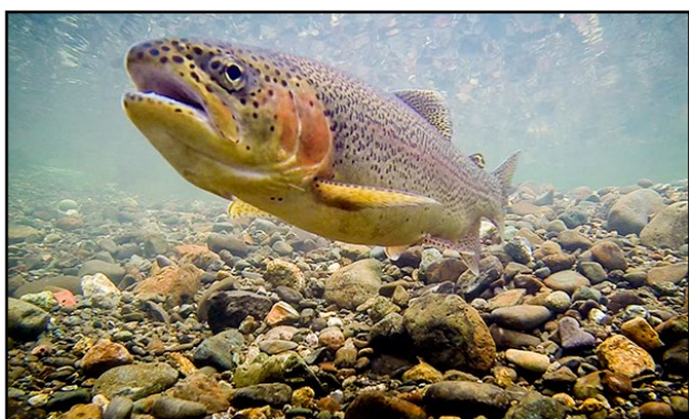
Female rainbow trout above her redd near the Harris property line.