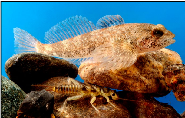
Benthic invertebrate (stonefly) hiding under rock.