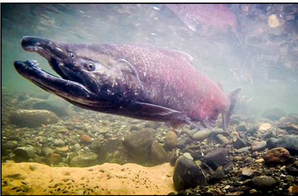
Magnificent male that courted females in the Scarification Control Section.