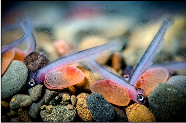
Steelhead alevin (Sac Fry) attempting to seek harbor in gravel. Gravel is too small to allow entry.

Subject: Putah Creek Fish Video Project - 2014 Salmon Run