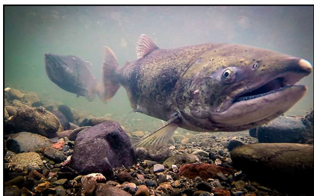
Salmon with larger cobble exposed by scarification.

Video: http://www.creekman.com/putah-salmon-2014.html