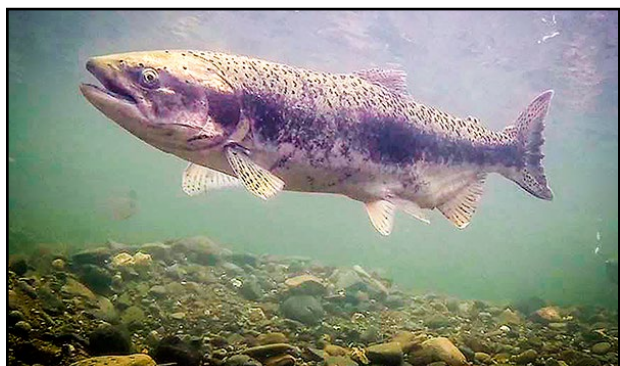
18 inch female Chinook at Scarification Section 3.

VIDEO: http://www.creekman.com/putah-salmon-2014.html