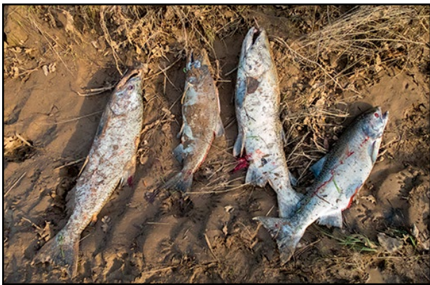
Five salmon were stranded in Mc Cune Creek. They entered the creek during the last storm event.

Submitted Via E-mail on February 24, 2015