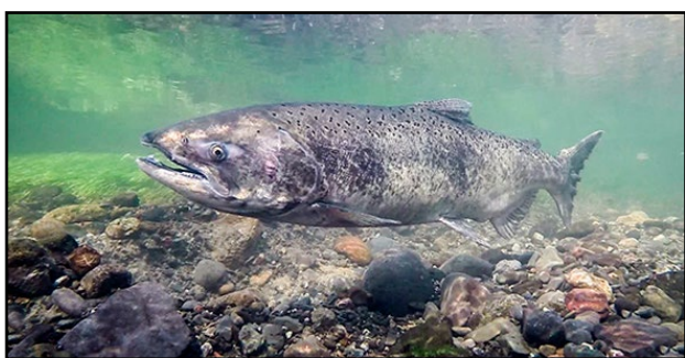
Female Chinook above shallow redd on Scarification Control Section Number 1. The redd was approximately 7 cm. in depth.