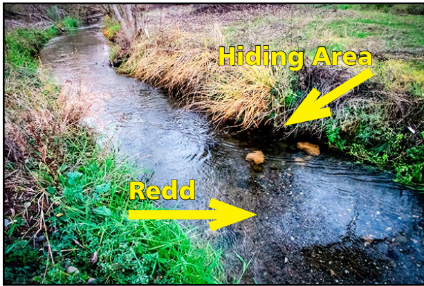
Salmon redd and hiding area. Pickerel North Side Channel. 12/10/14