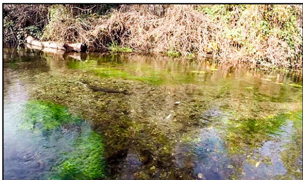
Female Chinook on shallow redd located in the Scarification Control Section Number 1.