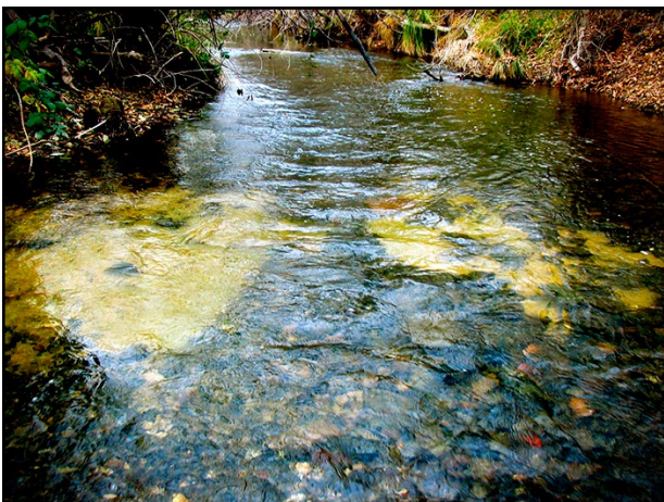
Salmon attempted to dig redds near I-505 (2005). Exposed claypan and marginal gravel was not sufficient for spawning.