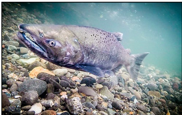
Male Chinook above a deep redd on Scarification Section No. 5.