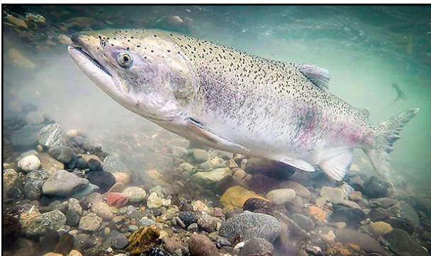
Female Chinook resting after digging a deep redd on Scarification Section No. 5.