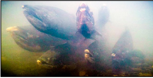
Gang of Seven. Beat-up, highly scarred salmon that were part of a run that came up the creek after the second storm. They settled on Scarification Section 4 on 12/ xxx/14.