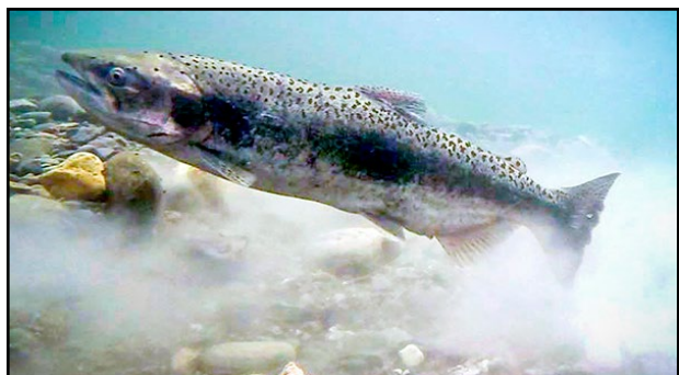
18 inch female Chinook after digging redd at Section 3.

VIDEO: http://www.creekman.com/putah-salmon-2014.html