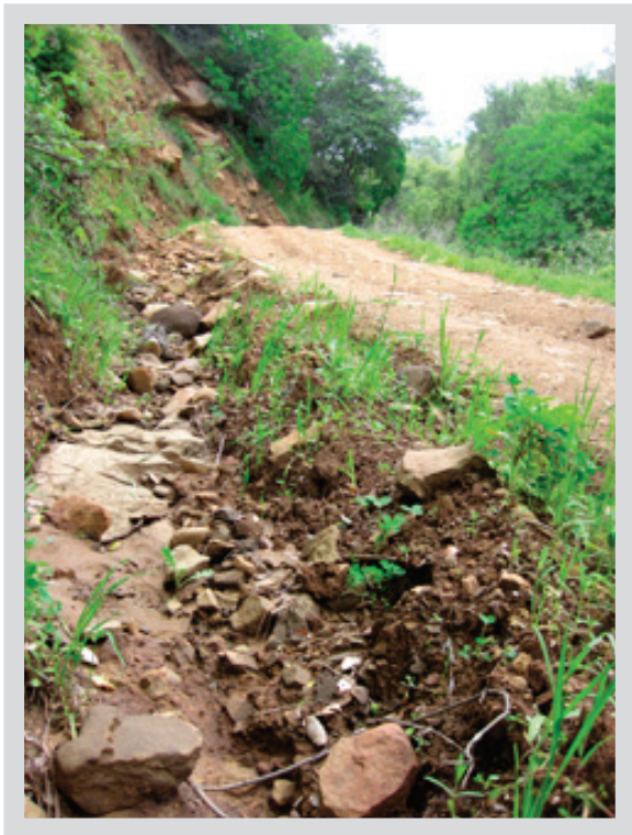
Gully along road into Thompson Canyon.