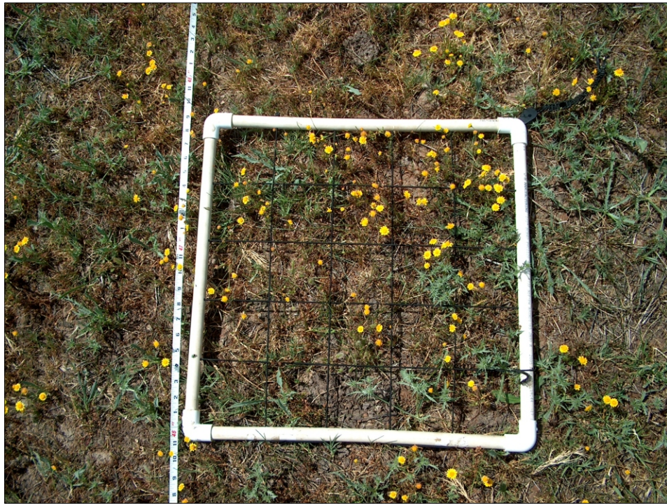
Low density quadrat, McCoy Basin study site.