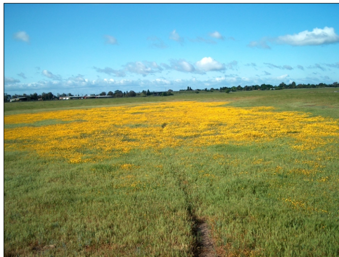
Photo was taken while standing to the north of the pool facing northwest. April 28, 2009.