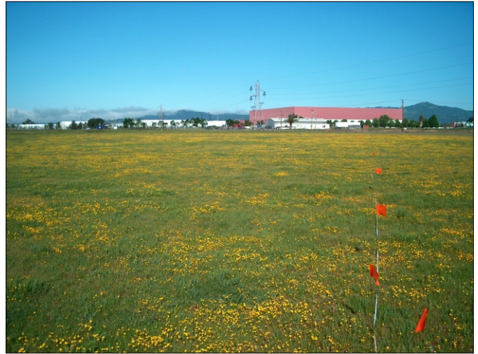
Photo was taken standing on the eastern side of the pool facing northwest. Photo also shows the population count transect. April 19, 2007.