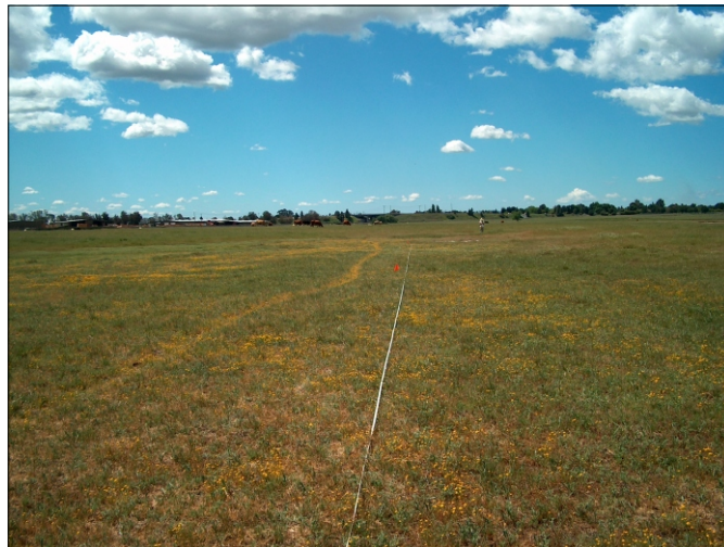
Photo was taken while standing to the north of the pool facing northwest. April 18, 2007.