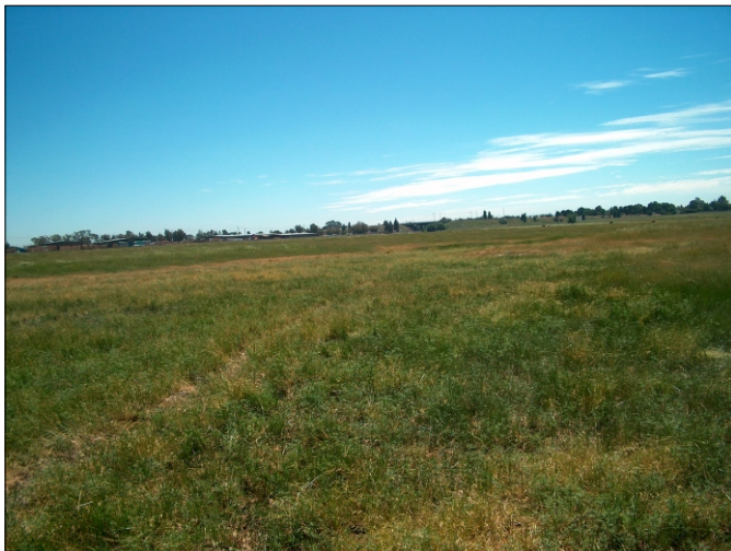
Photo was taken while standing to the north of the pool facing northwest. May 16, 2006.