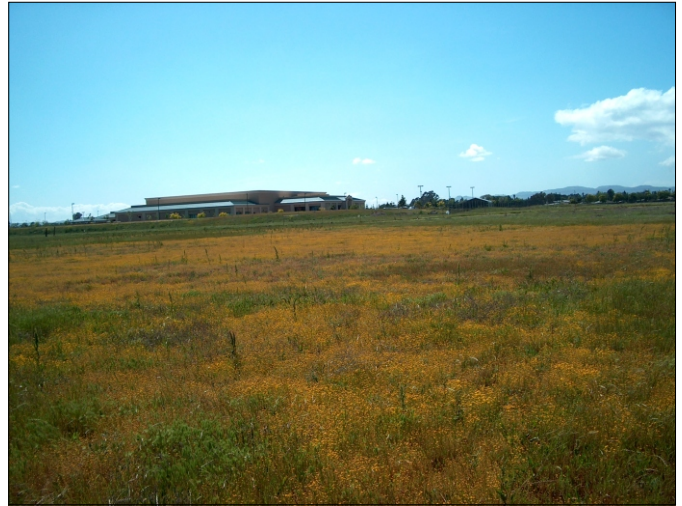
Photo was taken standing on the northeastern corner of the pool facing southwest, towards the Jehovah's Witness Assembly Hall. April 16, 2007.