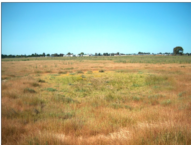
Photo was taken while standing to the north of the pool facing south towards McCoy Basin. April 19, 2008.