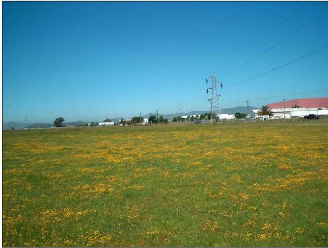
Photo was taken standing on the eastern side of the pools facing west. May 11, 2006.