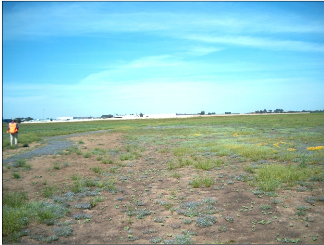
Photo was taken standing on the southwestern corner of the pool facing northeast, towards the salvage yard. May 10, 2006.