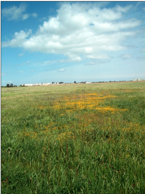
Photo was taken while standing on the western end of the pool facing east towards the salvage yard. April 17, 2007.