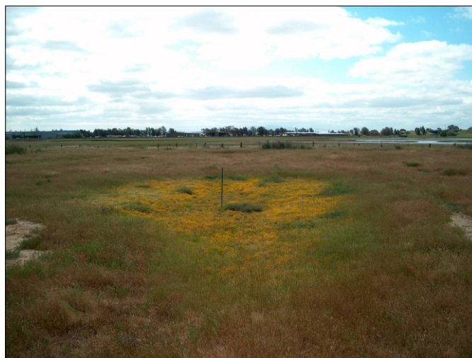
Photo was taken while standing to the north of the pool facing south towards McCoy Basin. April 28, 2009.