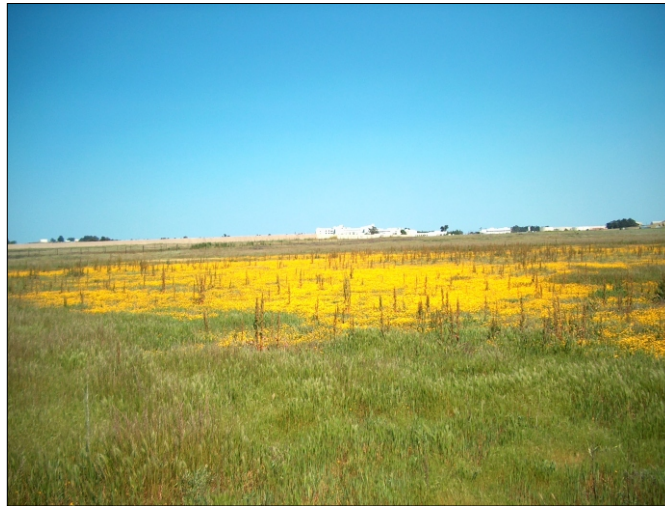
Photo was taken standing on the southwestern corner of the pool facing northeast, towards the salvage yard. May 4, 2008.