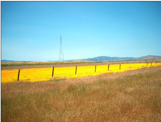
Northwestern section of the playa pool. Photo was taken standing on the southeastern corner of the pool facing north. April 25, 2008.