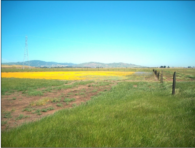
Northwestern section of the playa pool. Photo was taken standing on the southeastern corner of the pool facing north. May 17, 2006.