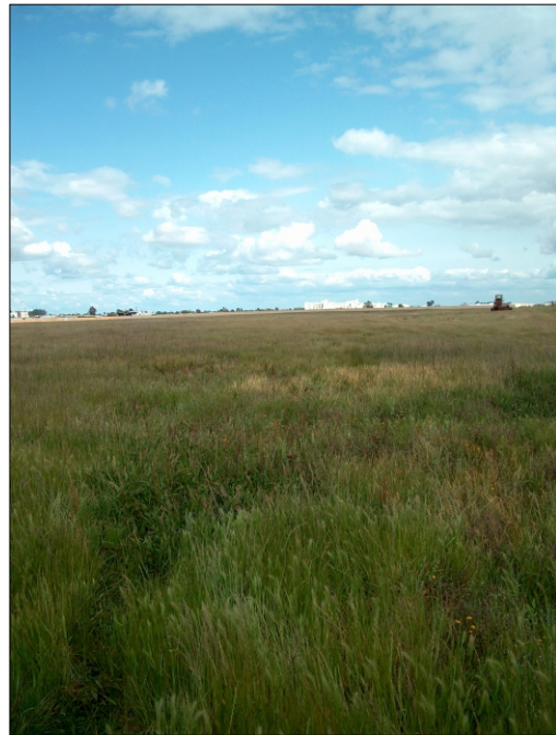
Photo was taken while standing on the western end of the pool facing east towards the salvage yard. May 4, 2008.