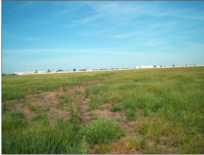
Photo was taken while standing on the western end of the pool facing east towards the salvage yard. May 10, 2006.