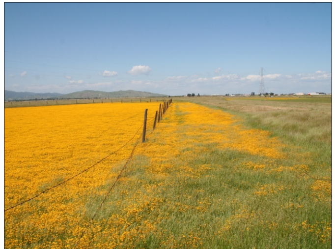
Photo was taken standing on the southeastern corner of the pool facing north. April 24, 2009.