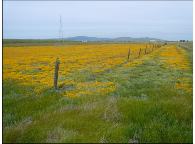
Northwestern section of the playa pool. Photo was taken standing on the southeastern corner of the pool facing north. April 12, 2007.