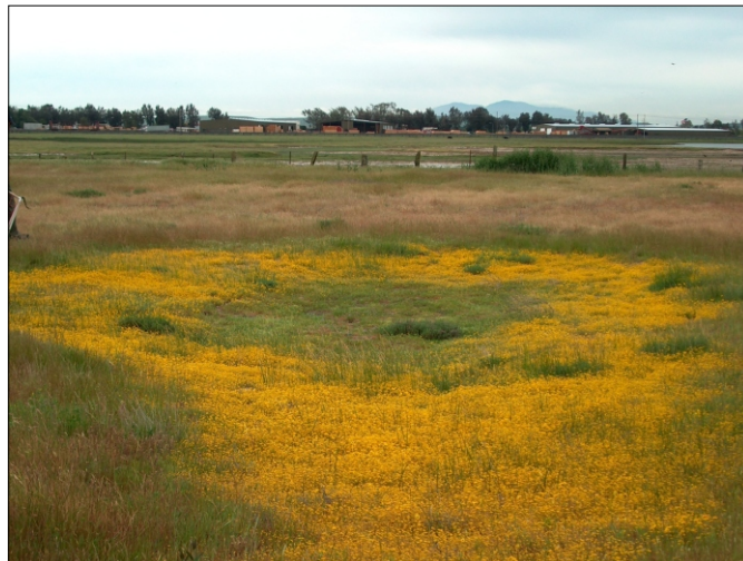
Photo was taken while standing to the north of the pool facing south towards McCoy Basin. April 19, 2007.