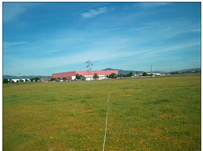
Photo was taken standing on the eastern side of the pool facing northwest. April 28, 2009.