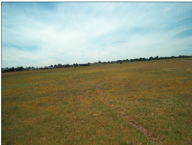
Photo was taken while standing to the north of the pool facing northwest. May 4, 2008.