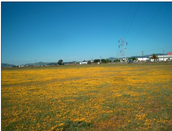
Photo was taken standing on the eastern side of the pool facing west. April 14, 2008.