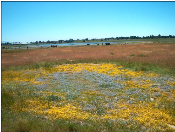
Photo was taken while standing to the north of the pool facing south towards McCoy Basin. May 18, 2006.