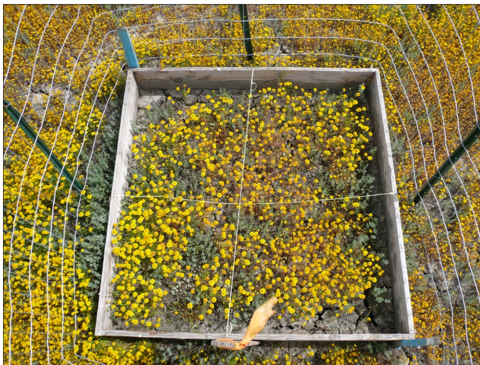
CCG removal plot 1 (take 4/4/2007)