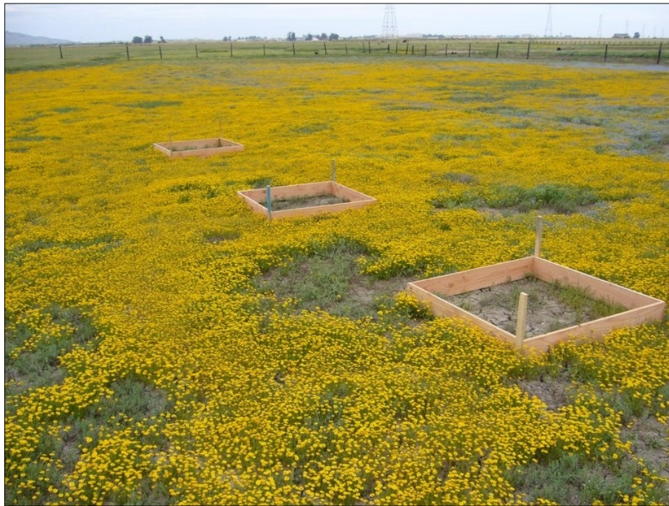
All three 1m 2 CCG removal plots with wood frames (taken 5/19/2006).