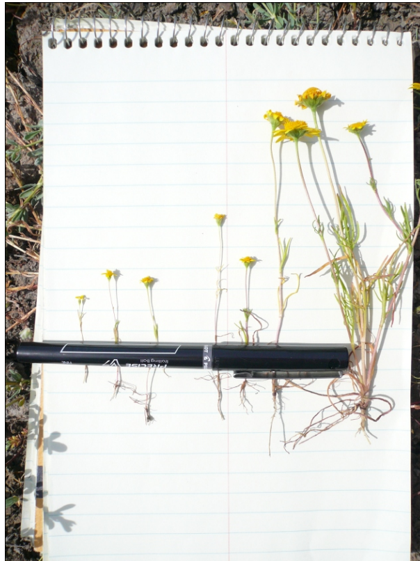
Variation in plant sizes removed from the plots in the spring of 2007 (taken 4/4/2007)