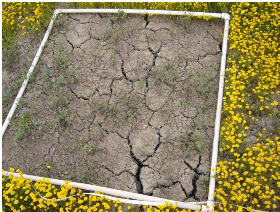
1m 2 CCG removal plot in the northwestern portion of the playa pool on the Director's Guild study site after CCGs were removed (taken 5/19/2006).