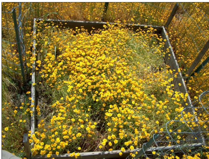
CCG removal plot 3 (taken 4/28/2009)