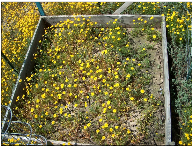
CCG removal plot 1 (taken 5/4/2008)