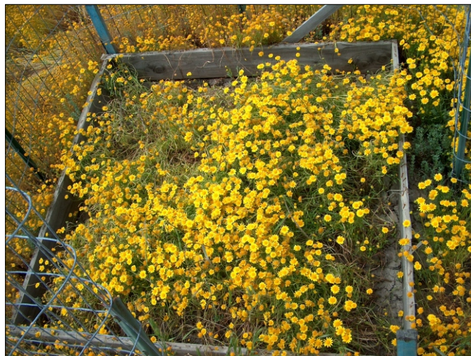
CCG removal plot 2 (taken 4/28/2009)