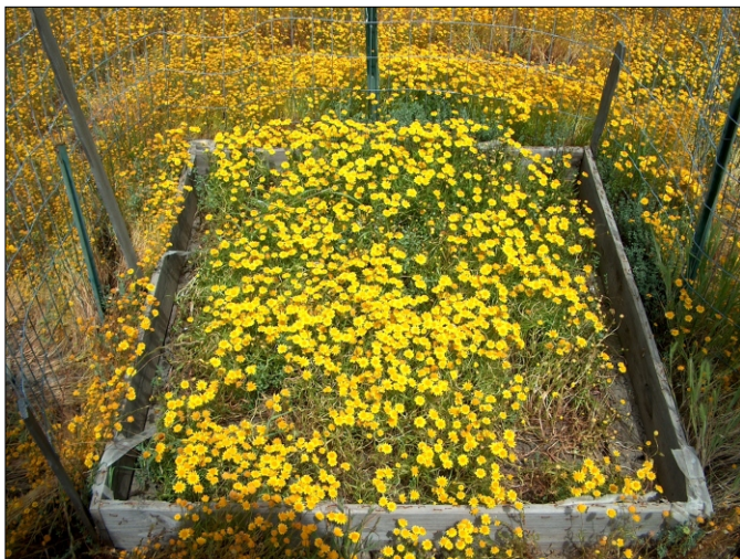
CCG removal plot 1 (taken 4/28/2009)