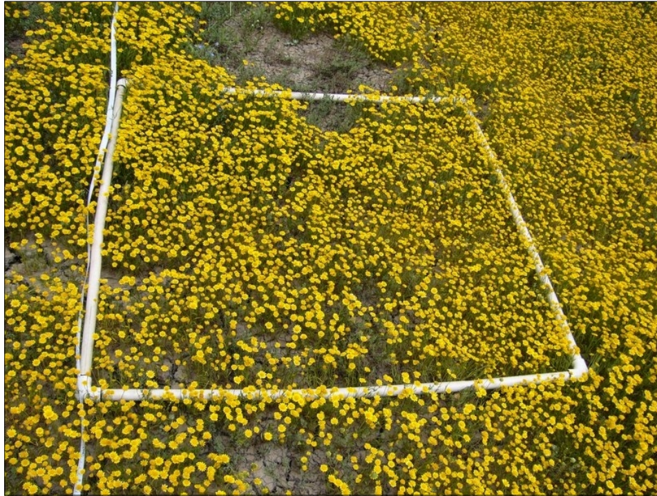
1m 2 plot with CCGs in the northwestern portion of the playa pool on the Director's Guild study site prior to the removal of CCGs (taken 5/19/2006).