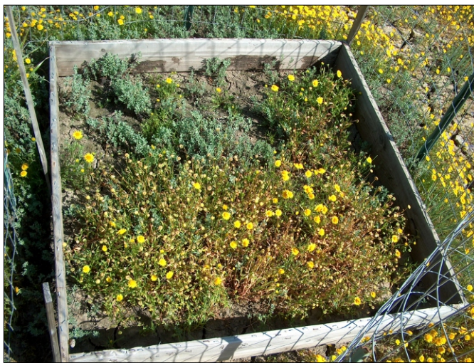
CCG removal plot 3 (taken 5/4/2008)