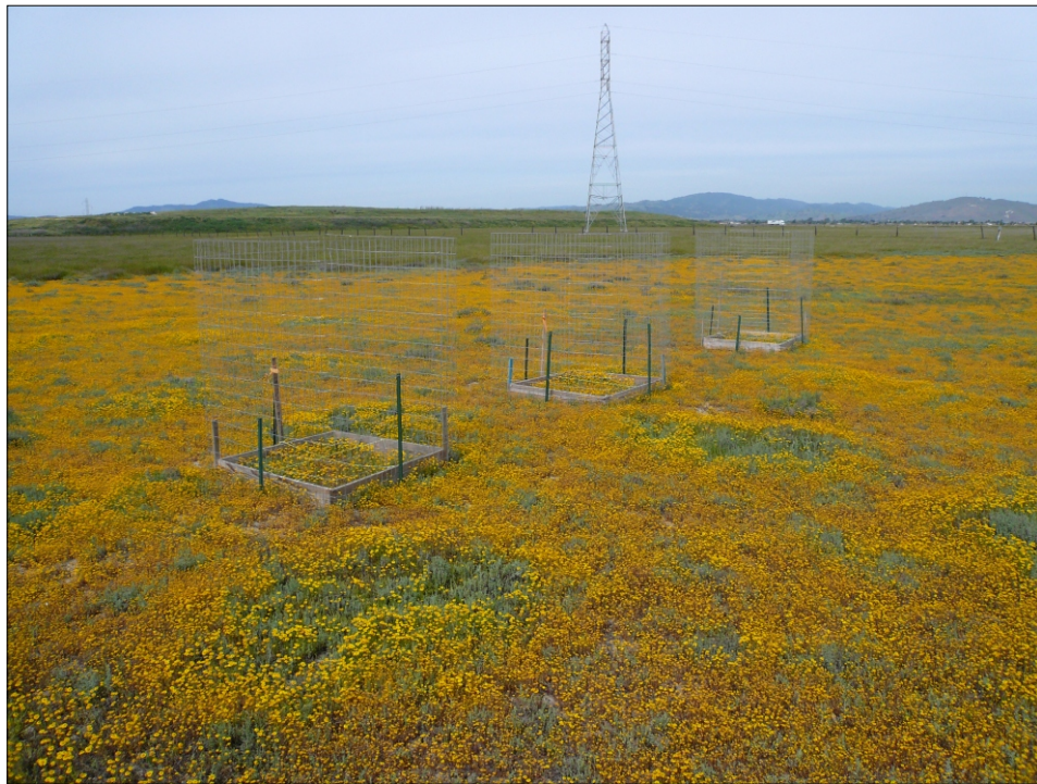
All three 1m 2 CCG removal plots in the spring of 2007 (taken 4/4/2007).