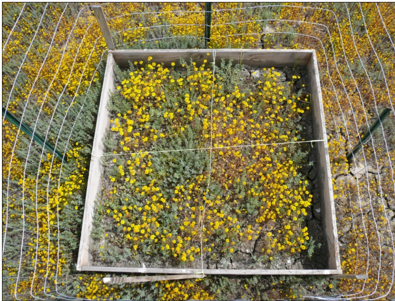
CCG removal plot 3 (take 4/4/2007)