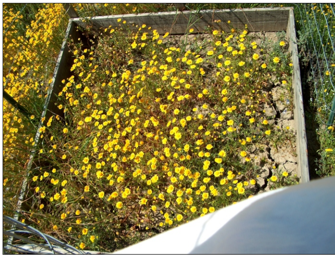
CCG removal plot 2 (taken 5/4/2008)