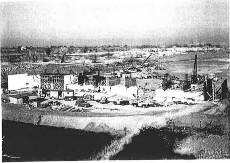
Figure 7. The Solano Diversion Dam during construction in 1956 and 58 years later. The area below the dam the along entire waterway was cleared of all vegetation and channelized. The large closed canopy trees found at the site today, are quite unlike the historic creek.