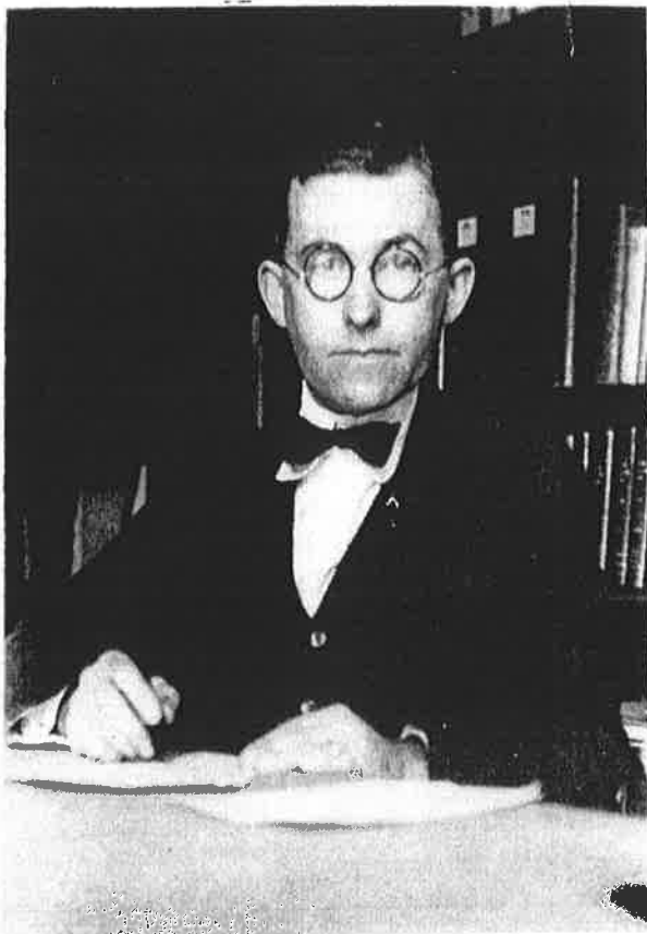
Figure 1. Tracy Irwin Storer, ca. 1920.